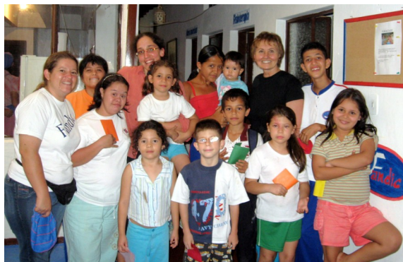
CAPD volunteers share their expertise with our partners. They are rewarded with long-lasting friendships.

Our Integration program is carried out by registered non-profit community-based disability organizations with whom CAPD has long standing relationship. FANDIC and ASODISPIE provide programs promoting integration in Bucaramanga, Piedecuesta, and Mesa de los Santos, Santander. Small business activities include construction of adapted equipment and wheelchairs, a bakery, a small store, and candle and soap making. Canadian volunteers provide training workshops and consultation to these organizations.