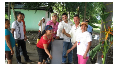
Left: Compacting wet concrete within the filter mold.

This program trains rural and peri-urban families living without treated water in the construction of BioSand water filters, hygiene, and hand washing. Projects are underway in various regions of Colombia.