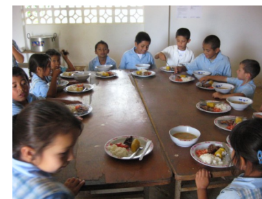
Students model their new uniforms and enjoy lunch in the school restaurant.